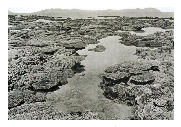
Stone Island, Great Barrier Reef ~1893