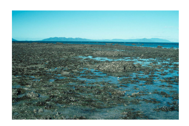
Stone Island, Great Barrier Reef 1994